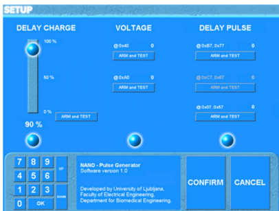
Figure 4: Setup screen of the GUI

Our black-box-based quality assessment of the input parameters (i.e. the on-screen numerical keypad and the on-screen sliders) of the main and the setup screens (1.1. and 2.1. in Table 1) revealed no errors present when entering these input parameters. However, the code inspection of the input-parameter handler source code showed serious memory-related errors: a memory leakage as a consequence of undisposed memory pointers was found and eliminated, thus resulting in an increased quality of the developed GUI software.