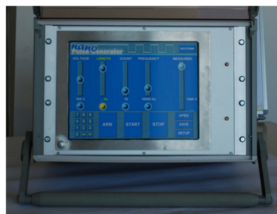
Figure 2: Developed high-voltage signal generator (nanopulse electroporator)

The developed high-voltage signal generator [7] is shown in Fig. 2.